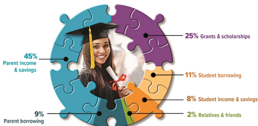
College funding sources for the 2020–2021 school year

Source: How America Pays for College , 2021, Sallie Mae