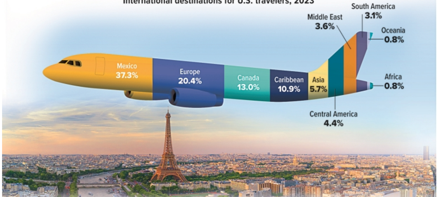
International destinations for U.S. travelers, 2023