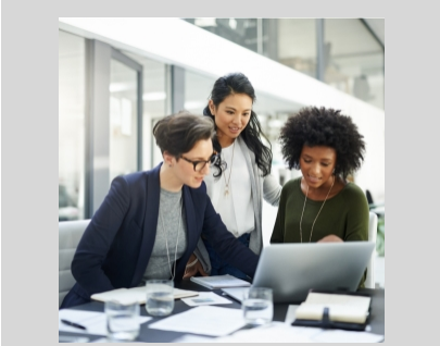
The IPO process is important to the financial markets because it helps fuel the growth of young companies and adds new stocks to the pool of potential investment opportunities.