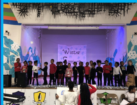
Belair-Edison Elementary Pre-K students sang beautifully at their Winter Choir Concert!