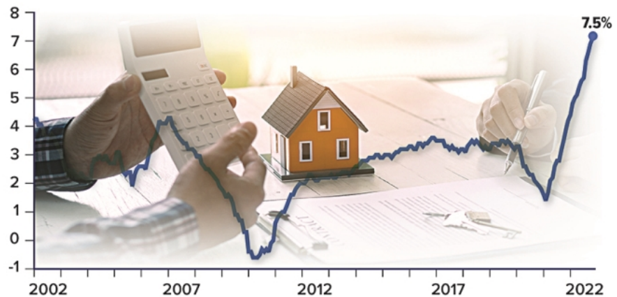
12-month change in shelter costs (CPI-U)